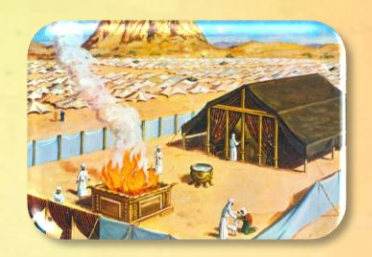
With the people of Israel (Ex. 29:43-45)