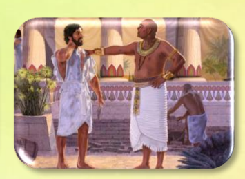
With Joseph (Gn. 39:2)