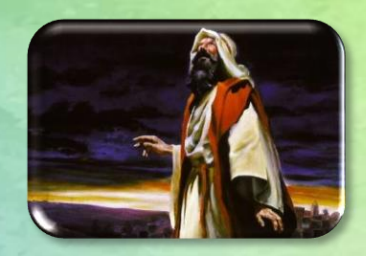
With Abraham (Gn. 17:7)

The Bible records several occasions when God Himself came down to see humankind (Genesis 11:5; 18:20-21; Exodus 3:7-8). But apart from these specific events, we see that God desired to be personally with us: